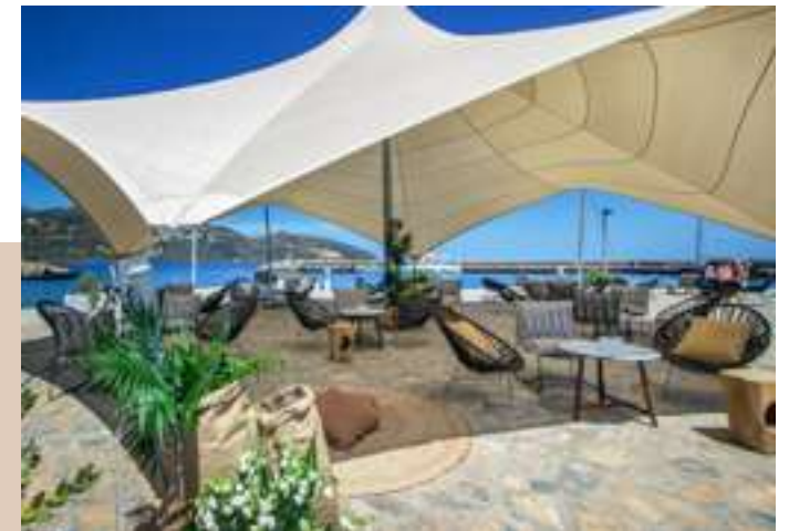
THE YACHT CLUB