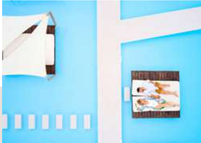
MAIN POOL AREA