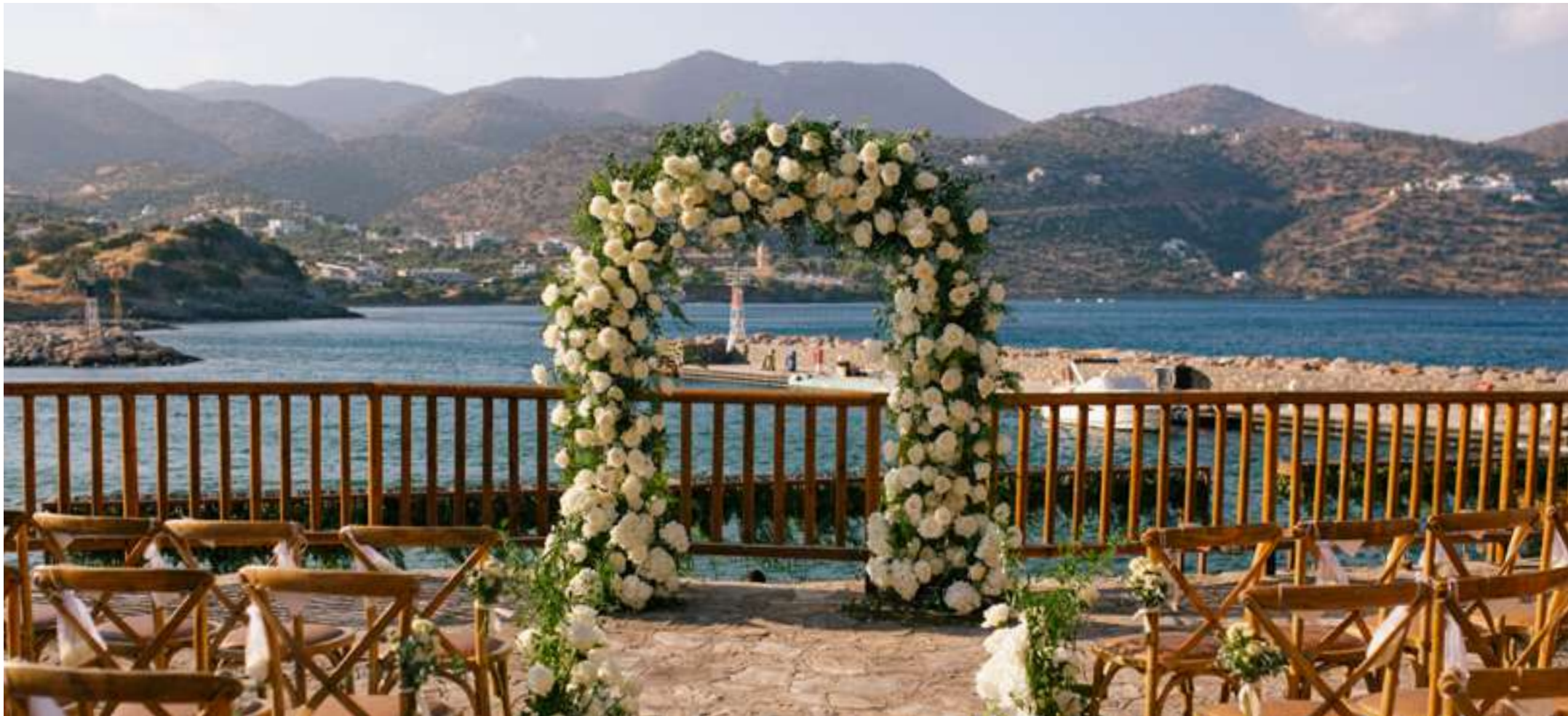
Photo Credits: Wedding planner: Double A Wedding | doubleawedding.com Photographer: @konstantinos_gkekopoulos | www.instagram.com/konstantinos_gkekopoulos/