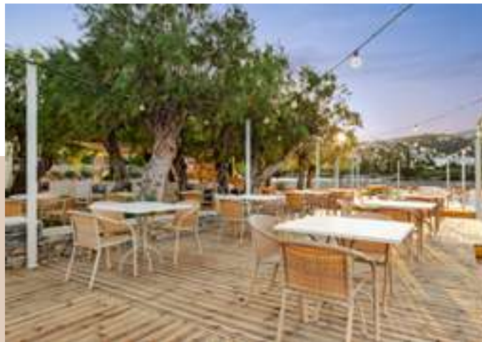
BAHIA MAR GRILL RESTAURANT